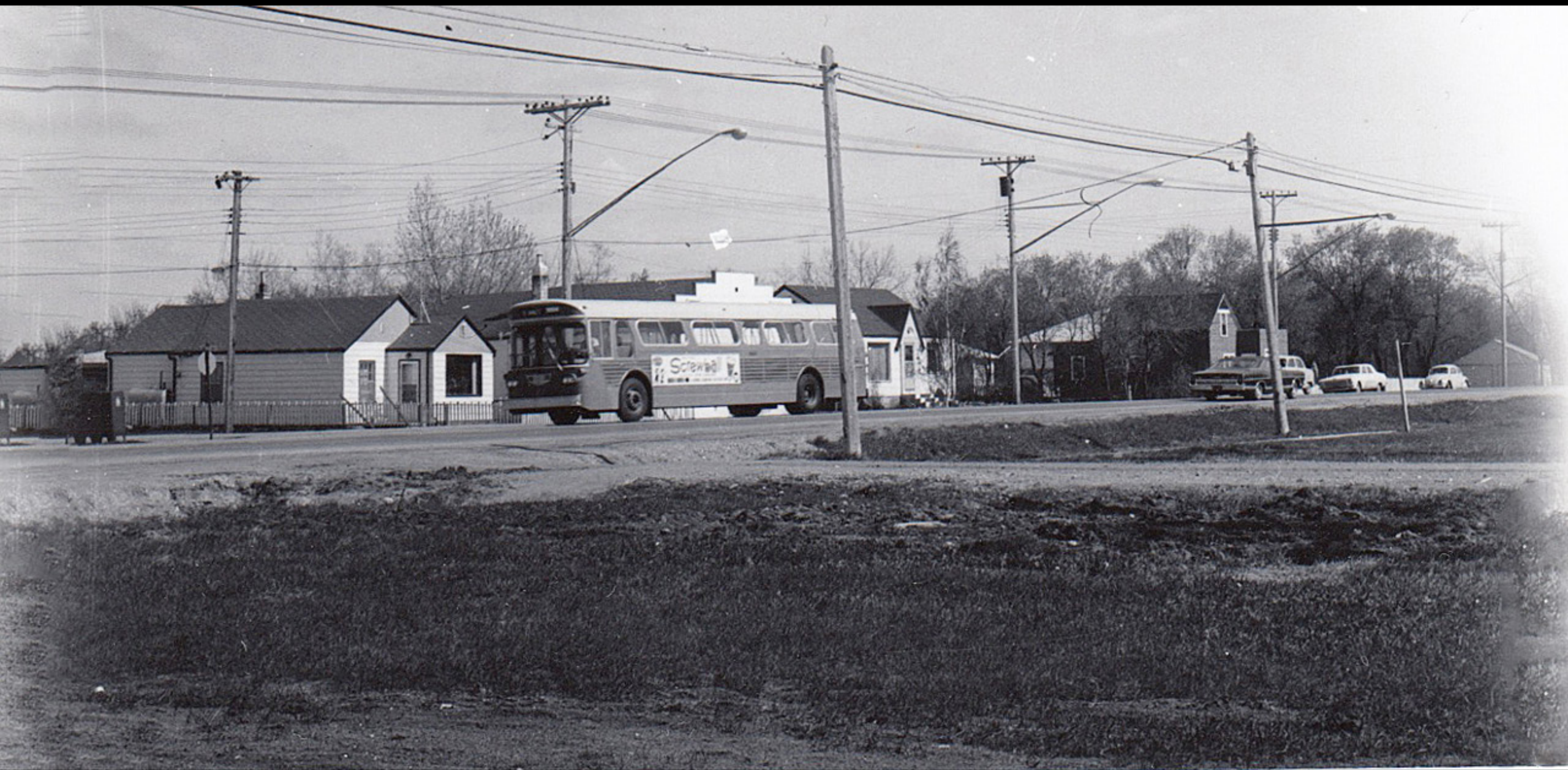
Transit Bus heading north on St. Anne's Road at Lavallee Road c1960.